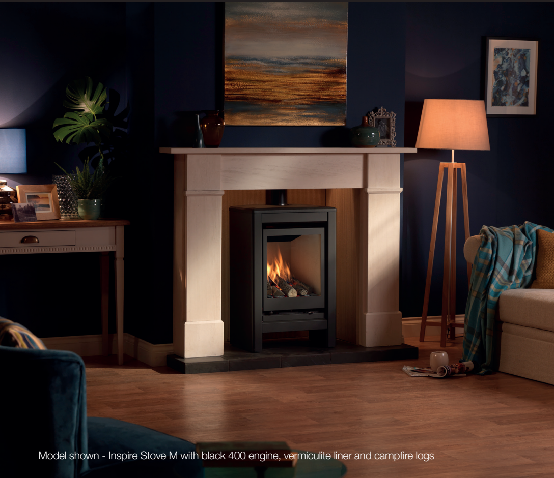
Model shown - Inspire Stove M with black 400 engine, vermiculite liner and campfire logs