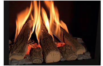
Luminaire LED Technology